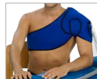
Shoulder bandage [3]