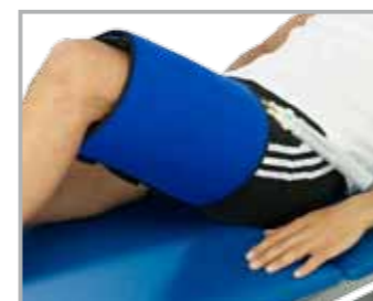
Thigh bandage [5]