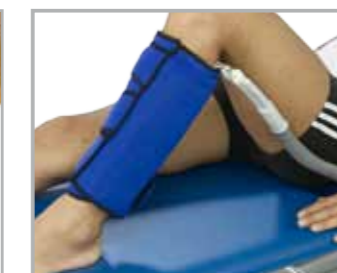
Knee / Calf bandage [6]