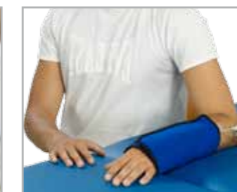
Elbow / Wrist bandage [4]