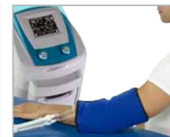
Elbow / Wrist bandage [4]