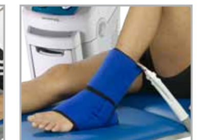
Ankle bandage [7]